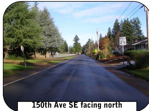
150th Ave SE facing north