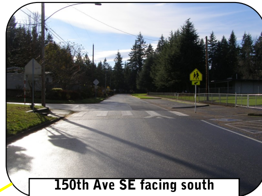
150th Ave SE facing south