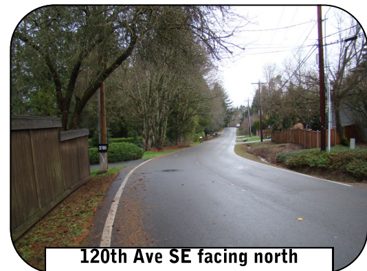
120th Ave SE facing north