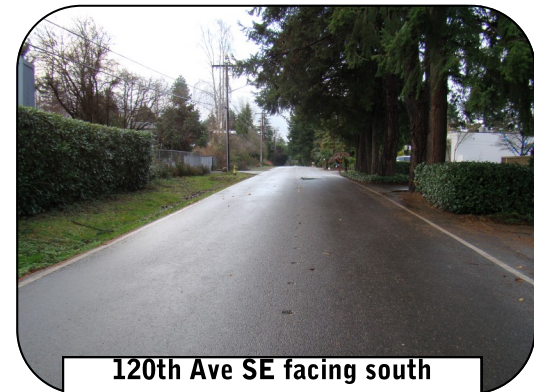
120th Ave SE facing south