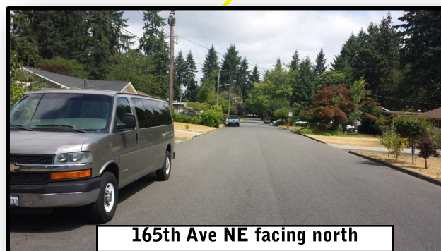
165th Ave NE facing north