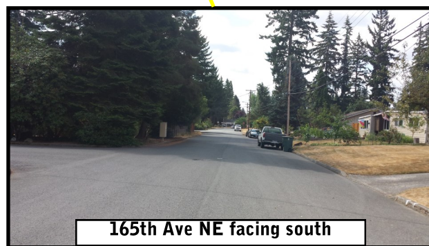
165th Ave NE facing south