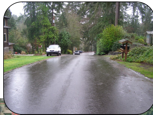
SE 18th St, facing east