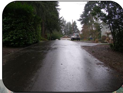
SE 18th St, facing west