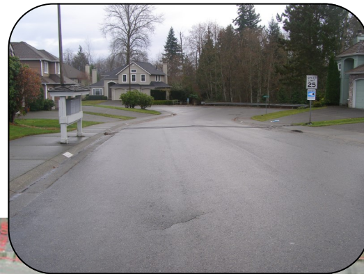
SE 47th Pl, facing east