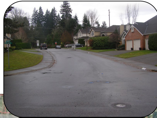
SE 47th Pl, facing west