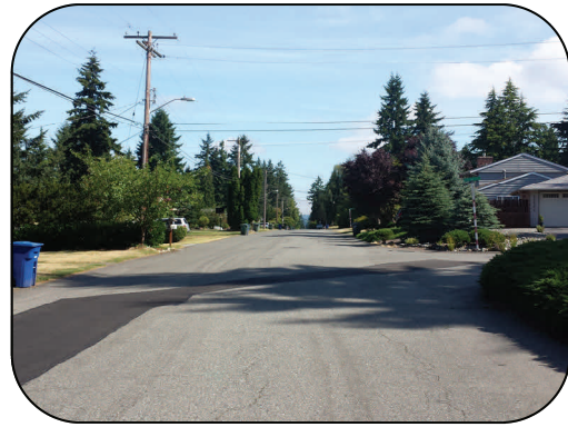
125th Ave SE south of SE 54th St,