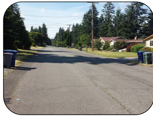
125th Ave SE north of SE 53rd St,