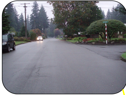
153rd Ave SE south of SE 25th St, facing north