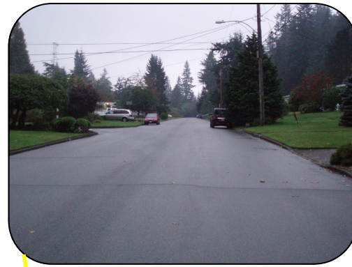
153rd Ave SE north of SE 25th St, facing south