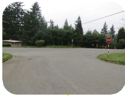
SE 38th St facing 140th Ave SE