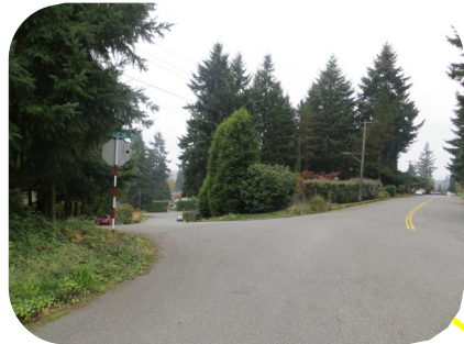
140th Ave SE facing northwest towards 139th Pl SE