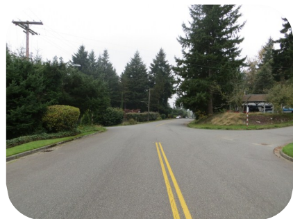
140th Ave SE facing north