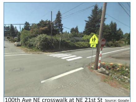
100th Ave NE crosswalk at NE 21st St