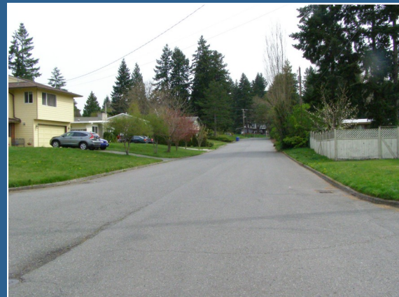
Looking east on SE 4th Street