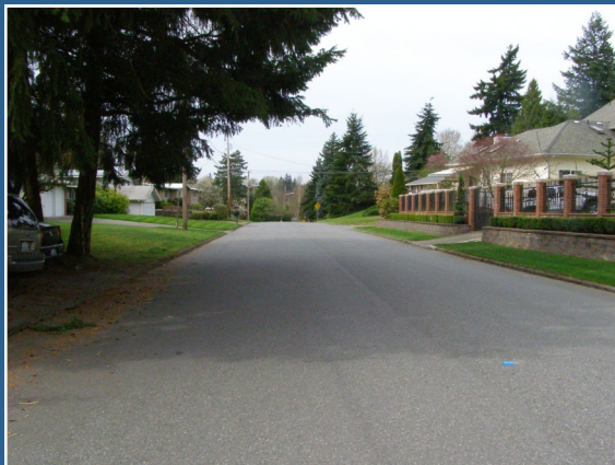
Looking west on SE 4th Street