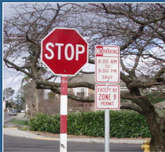
The area of concern is located in a Residential Parking Zone that allows for parking by permit holders only.