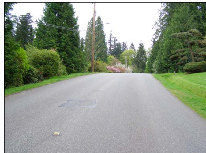
Southbound 102nd Ave NE north of NE 33rd Street