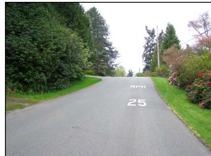
Northbound 102nd Ave NE south of NE 33rd Street