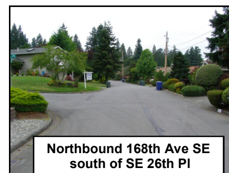
Northbound 168th Ave SE south of SE 26th PI