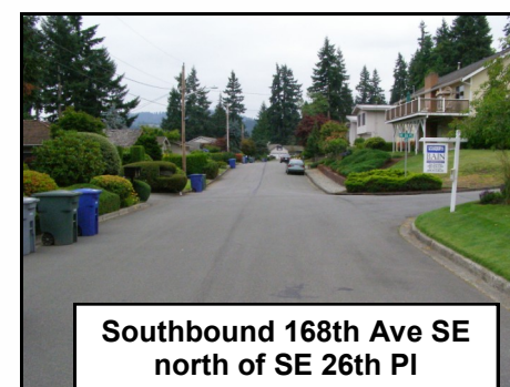
Southbound 168th Ave SE north of SE 26th PI

Please feel free to contact Brian Casey at bcasey@bellevuewa.gov or 425-452-6867 if you feel your neighborhood would benefit from participating in the programs or recommendations listed above.