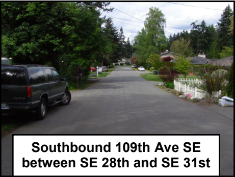
Southbound 109th Ave SE between SE 28th and SE 31st

Please feel free to contact Brian Casey at bcasey@bellevuewa.gov or 425-452-6867 if you feel your neighborhood would benefit from participating in the programs or recommendations listed above.