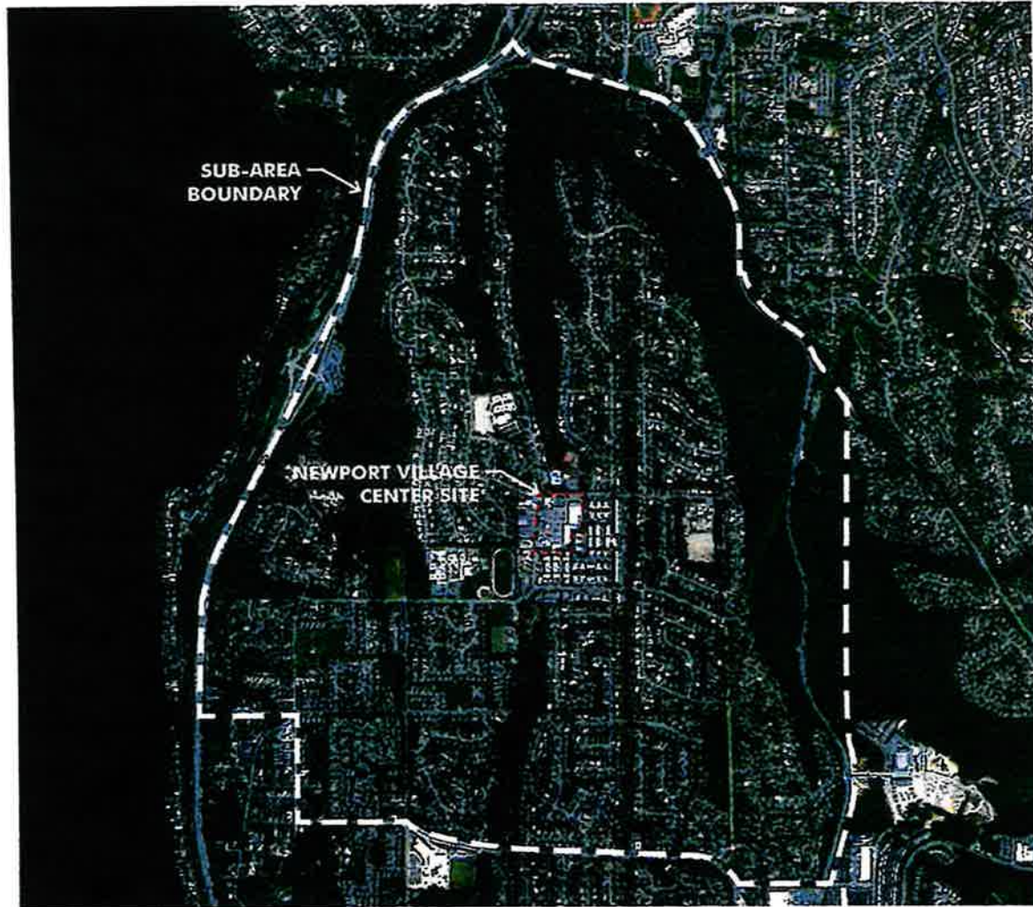
NEWPORT VILLAGE CENTER