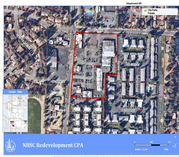
Neighborhood: Newport Hills

Policy LU-19: Support mixed residential/ commercial development in all Neighborhood Business, Neighborhood Mixed Use , and Community Business land use districts in a manner that is compatible with nearby uses.