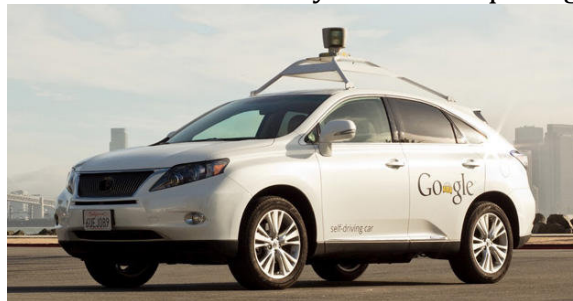
2: Google test car 2

Modern driverless cars will sense their environment (and other drivers) like a person, and will operate with true autonomy without requiring new infrastructure.