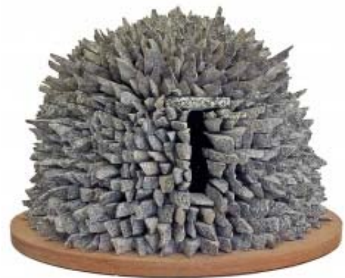
Vibrant Dome by Verena Schwippert

Exhibit co-sponsored by the City of Everett Cultural Arts Commission