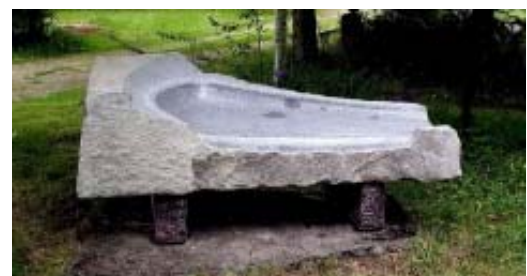
Divan by Verena Schwippert

My sculptures invite the touch and physical interaction of people; in fact, in a way they are not complete without this touch; the giant hands I make, invite folks to sit in them and feel the safe calm of the granite.