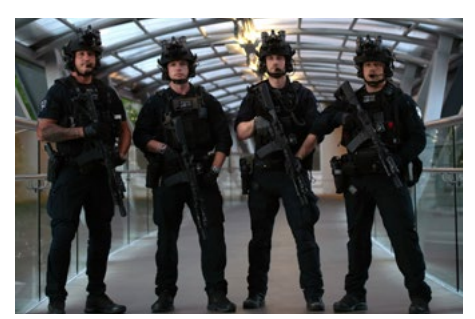
The Special Weapons and Tactics (SWAT) Team provides specialized support for high-risk incidents and search warrants, and team members assist with security at community events throughout the year.