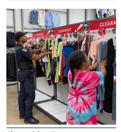
Shop with a Cop