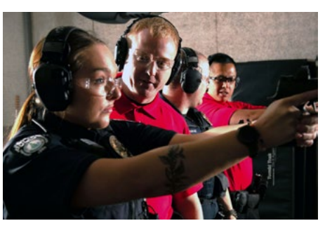
The Personnel Services Unit (PSU) is responsible for recruiting, hiring and training new employees of the Bellevue Police Department, as well as administering ongoing training.