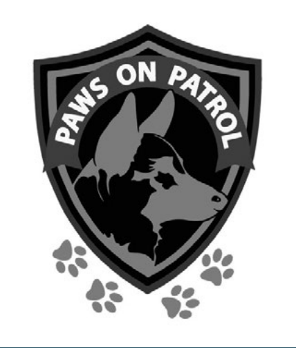
Paws on Patrol