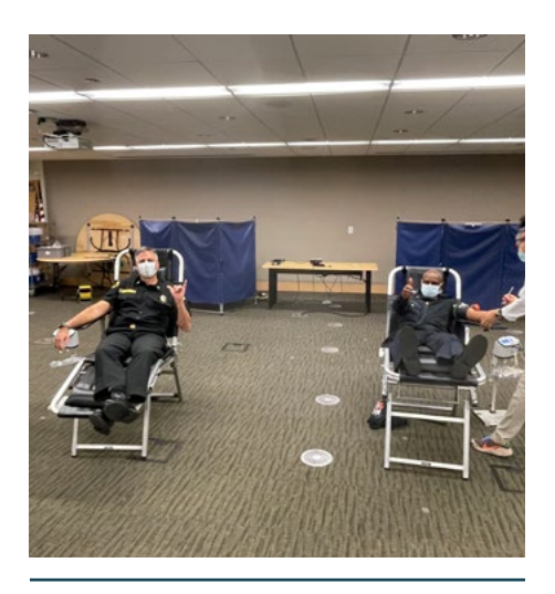
Battle of the Badges