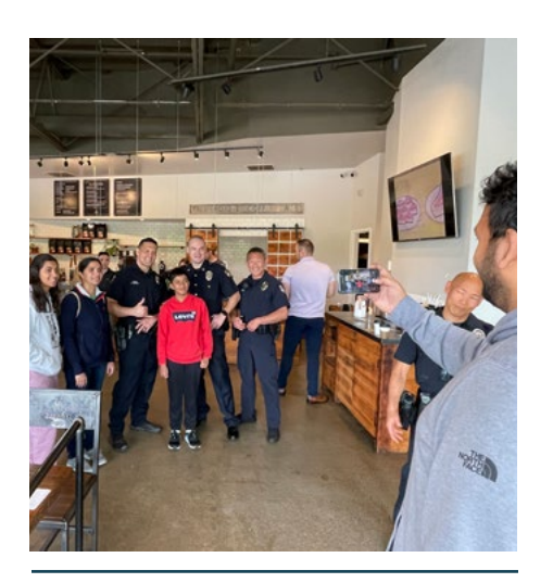
Coffee with a Cop