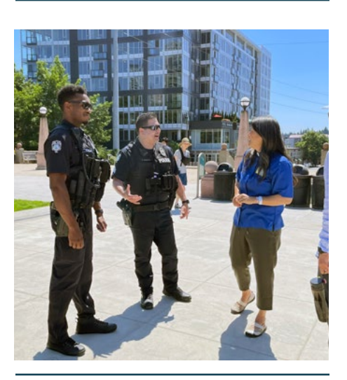
Advisory Council Picnic