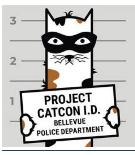
Project CATCON I.D.