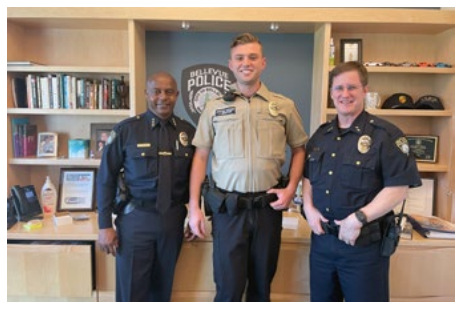
The Courts and Custody Unit is responsible for the transportation of prisoners to and from Bellevue District Court. The unit also assists patrol squads with the booking and transportation of prisoners.