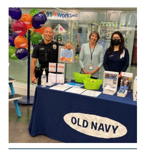
Crossroads Safety Fair