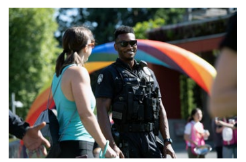
The Patrol Squads provide 24/7 police services to all those who live, work and play in Bellevue. Our patrol officers are responsible for response to all 911 emergency calls, routine calls for service, and proactive policing.