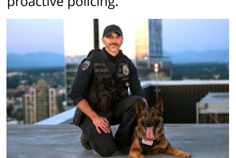
The K-9 Unit is responsible for visible patrol, response to in-progress calls, tracking fleeing suspects, searches, evidence location, and narcotics detection. The unit consists of a supervisor, three K-9 Officers, and three police dogs.