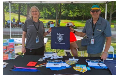
The Police Volunteers staff our police substations, provide disabled parking enforcement, and assist with a variety of other important functions within the department.