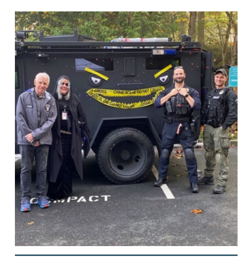
Halloween on the Hill