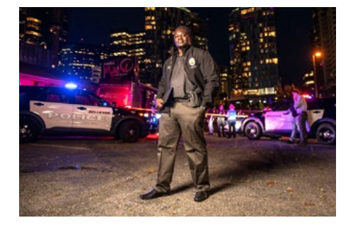
The Investigations Division includes property and economic crimes, violent crimes, special assault unit, crime analysis, digital forensics, forensics laboratory, special enforcement team, narcotics unit and vice unit, major crimes, and one Joint terrorism task force detective.