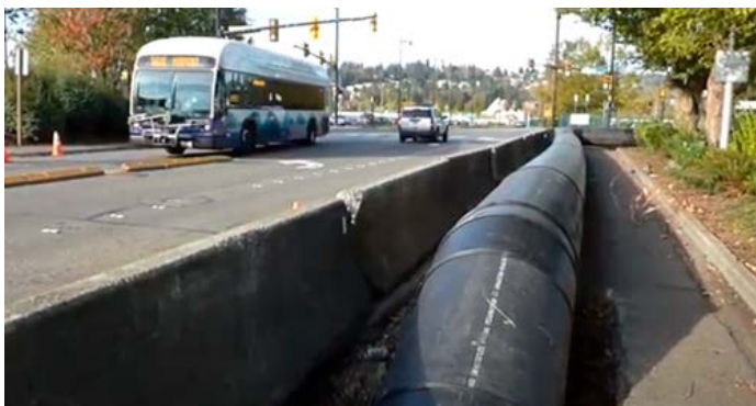
Example of a King County temporary detour pipe

The Lake Hills sewer pipe is aging and needs to be relined so it does not fail, overflow or disrupt service. Construction started in April in Bellevue, on the streets between 120th Avenue Northeast and Northeast Spring Boulevard, and will last up to seven months. Sewer service will be maintained during this work. Work hours will generally be 7 a.m. to 5 p.m. weekdays and weekends with occasional night work. King County's goal is to complete construction efficiently to minimize disruptions to the community. For more information, visit kingcounty.gov/lake-hills-sewer-relining or email Demmelash Adera at deadera@kingcounty.gov .