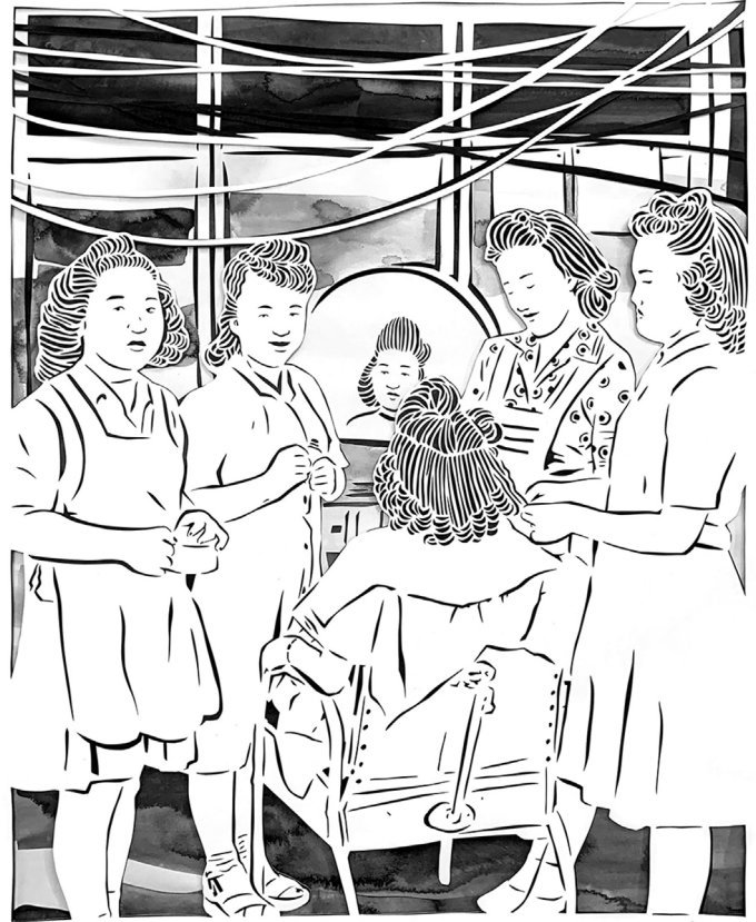
Keeping Up Appearances Hand-cut paper, ink 24" x 18"