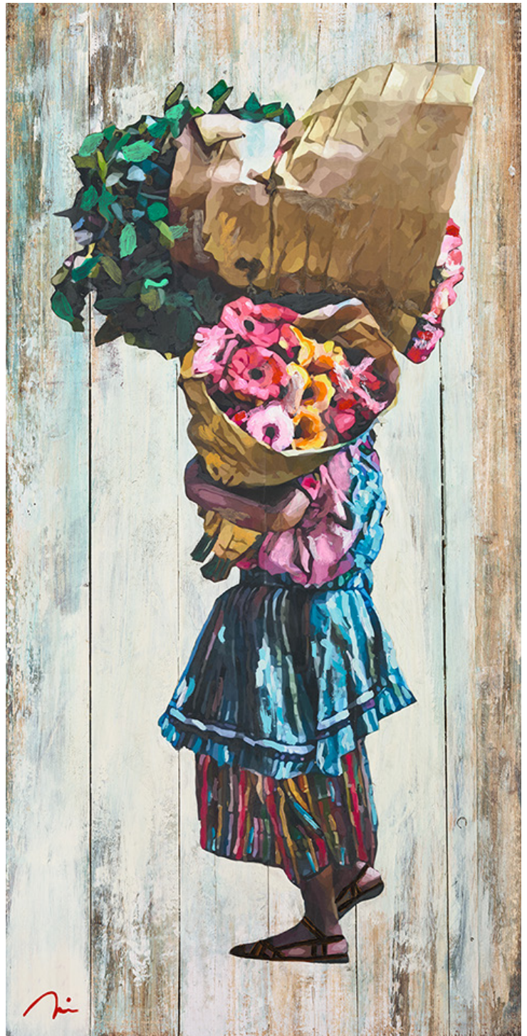
Flores Antigua Mixed Media 40" x 30" x 1.5"