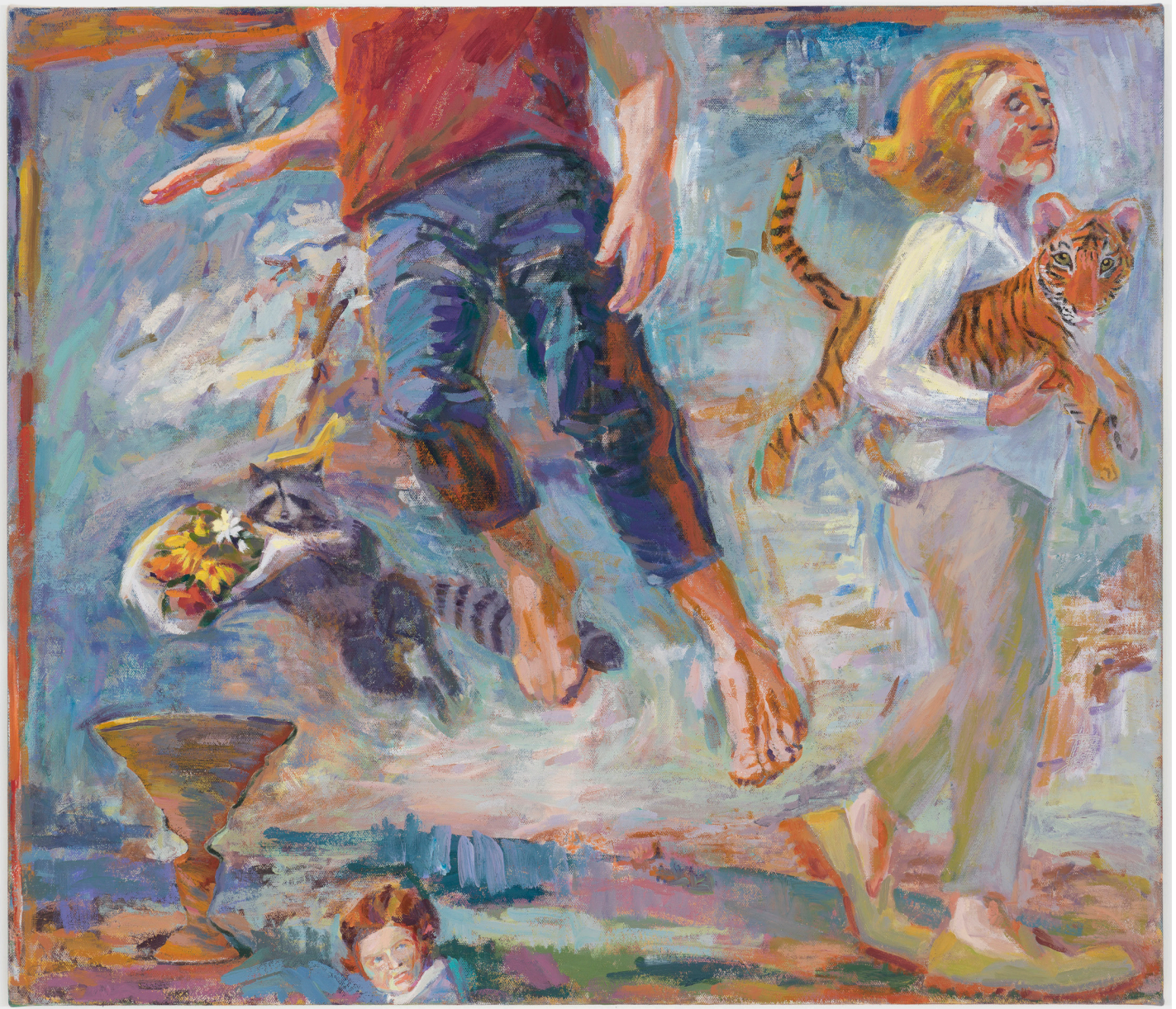
It's Actually Three Self Portraits