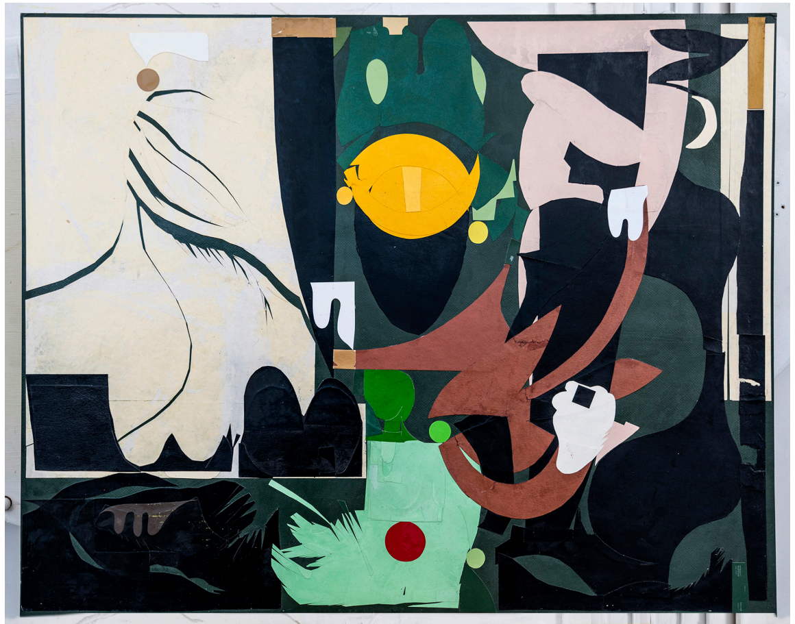
‘ The Internal Landscapes - (Early People) series ‘ for Retrato del Mundo project Collage with found papers, acrylic medium, acrylic gel, paint and other materials over thing wood 28” x 40”