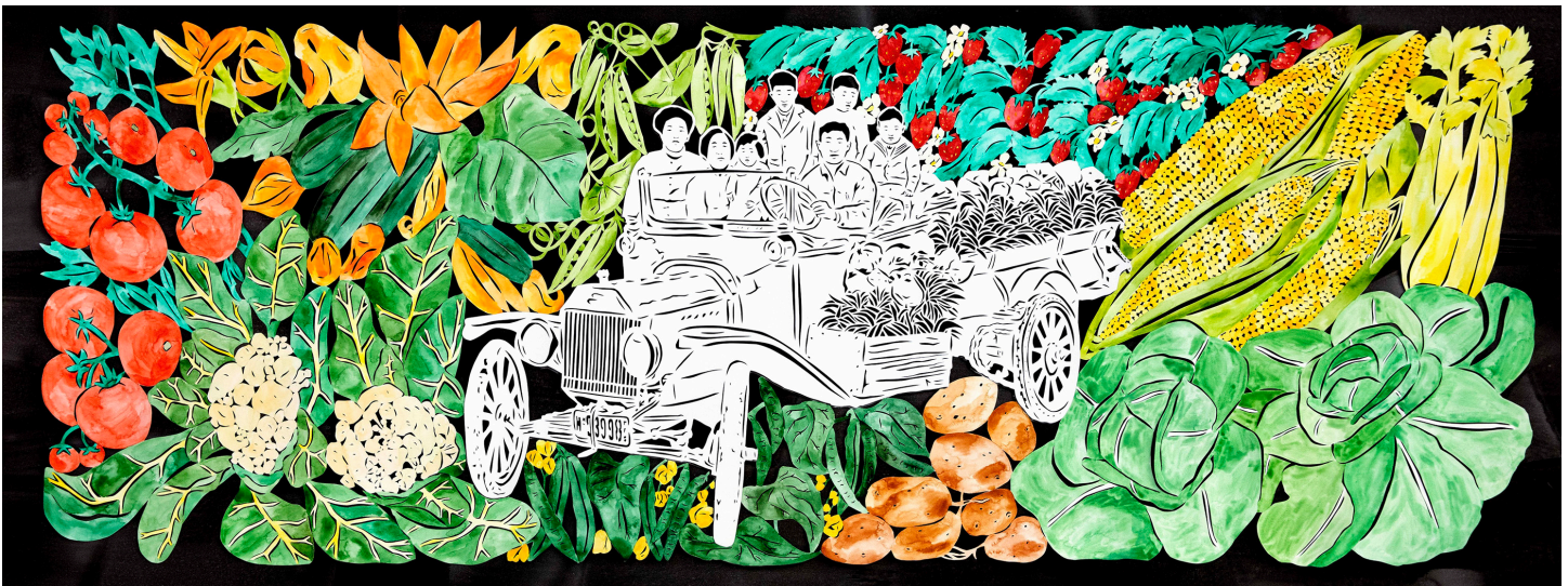
Harvesting Hope Layered, hand-cut paper, ink, watercolor 27" x 65"