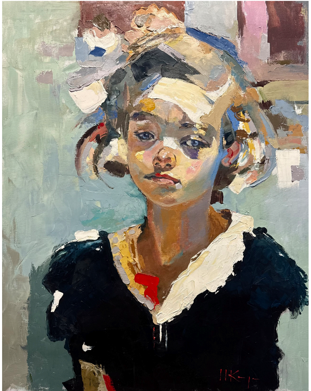
Youthful Gaze Oil on Canvas 34" x 40"