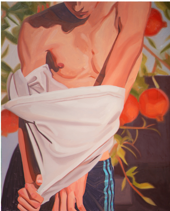
Sunbathing (with you)