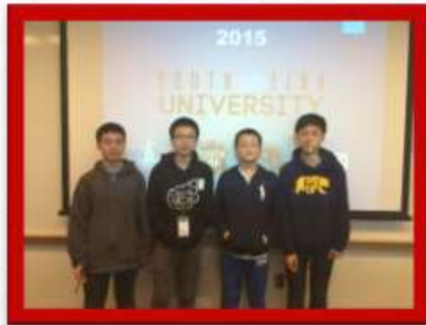
“Vote Goat” App