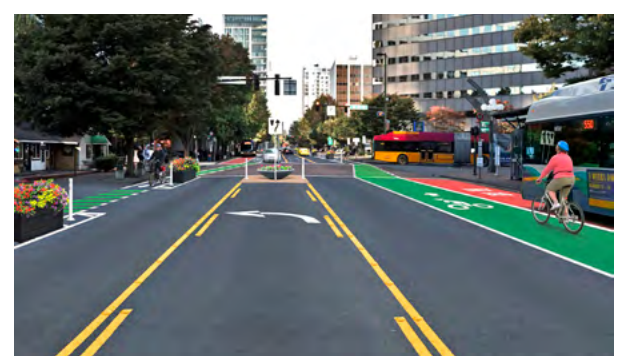
Draft Concept for 108th Ave NE, at the Bellevue Transit Center, looking north)