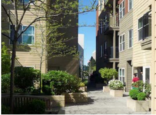
↑ Through-block connections can be intimate and designed to protect residents' privacy.

for additional evaluation of affordable housing regarding the nature of bonus, relationship to what market is delivering, and how it might tie in with multifamily tax exemption program being considered by Council.