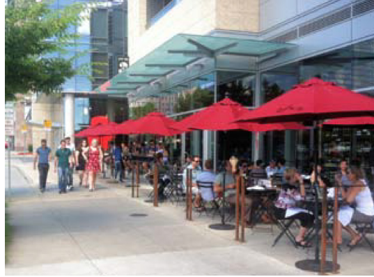
↑ People enjoying the amenities of 106th Avenue NE, the entertainment street.

Recognizing that a common theme is to reinforce and promote the unique identify of each neighborhood in Downtown, the CAC discussed the potential to weight incentives differently depending on where the development is located and the unique character and needs of each neighborhood.