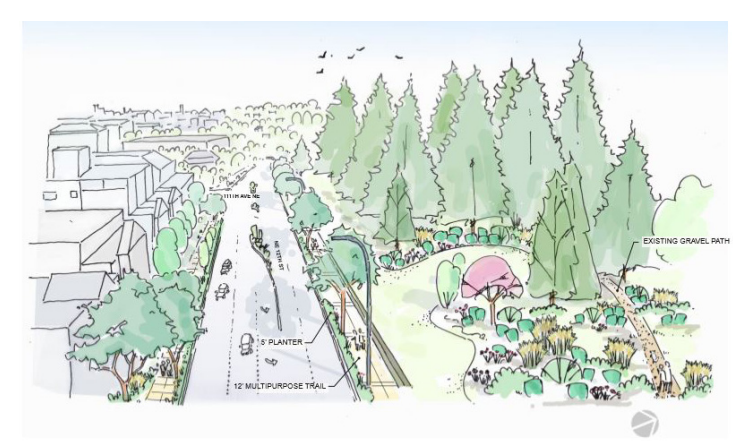
Rendering of NE 12th Street multipurpose path

Sara Haile, project manager 425-452-7835 | shaile@bellevuewa.gov