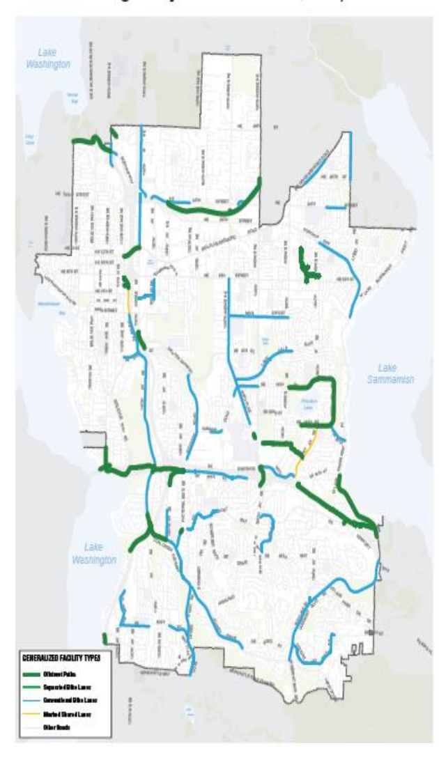
Resulting Bicycle Facilities, Post-BRIP