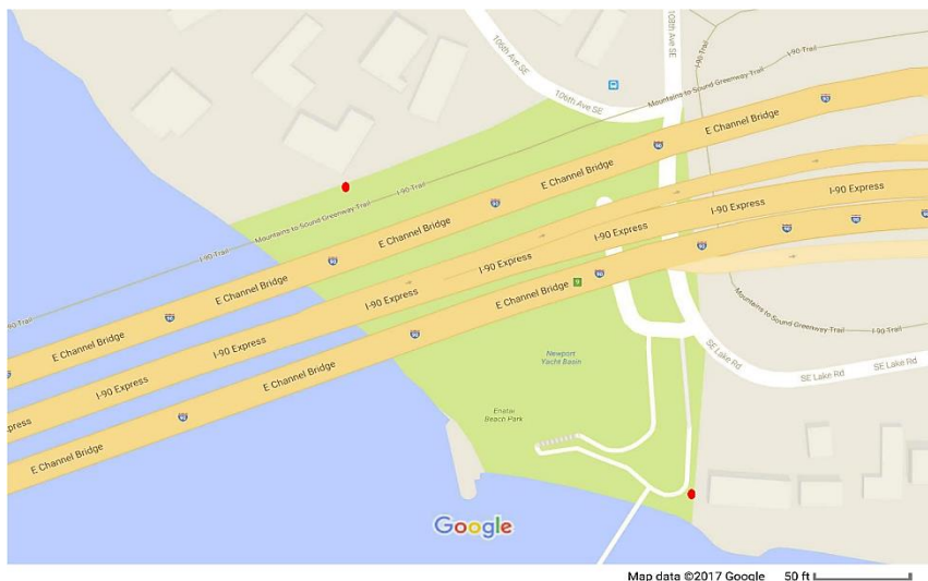
Approximate locations of noise monitoring equipment shown as red circles. Noise monitoring equipment will be placed in 2 locations near the park boundary.