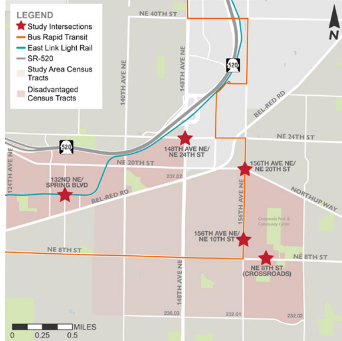
Figure 1: Study Area

Crossroads identify as an ethnic minority race. Bellevue has also chosen Crossroads to prototype the RTSSI project because it will benefit a significant older community (25% of the population is 65 years old or older), with an estimated 13% of the population reporting as having a disability. More than half of residents residing near Crossroads are seniors and children under 18.