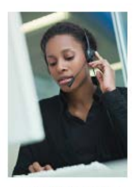
Customer Service Representative $18.68 / hour