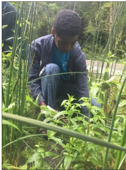
Left: Trainees remove weeds from a bioswale at Coal Creek Natural Area’s Red Cedar Trailhead. This project was part of a larger educational seminar about Low Impact Development techniques.