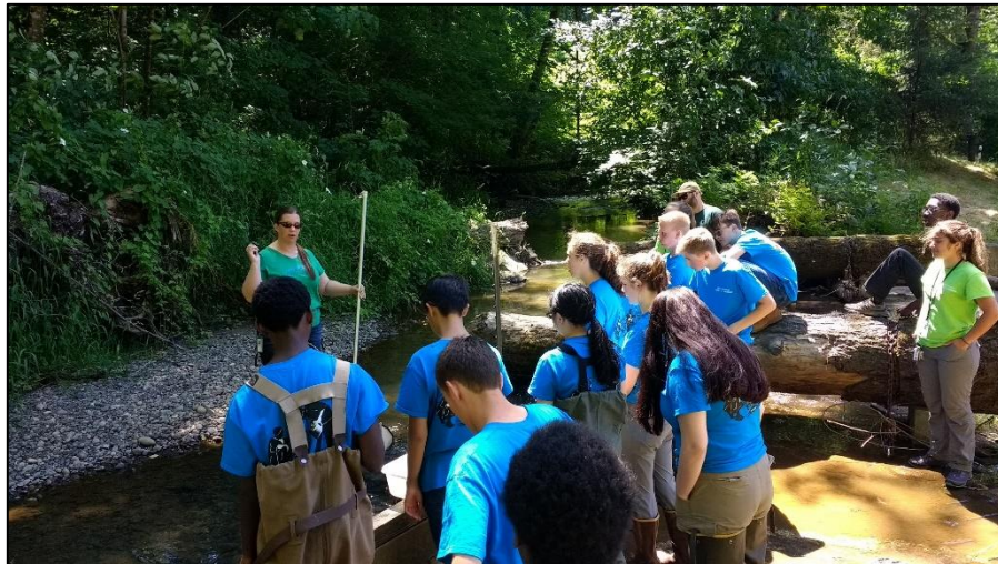
Above: The crew learning about aquatic invertebrates and stream health at Coal Creek Natural Area.