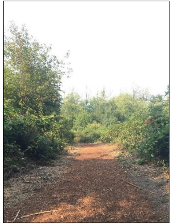
Left: Conditions at the beginning of trail construction. Right: New trail segment at Coal Creek Natural Area after completion.