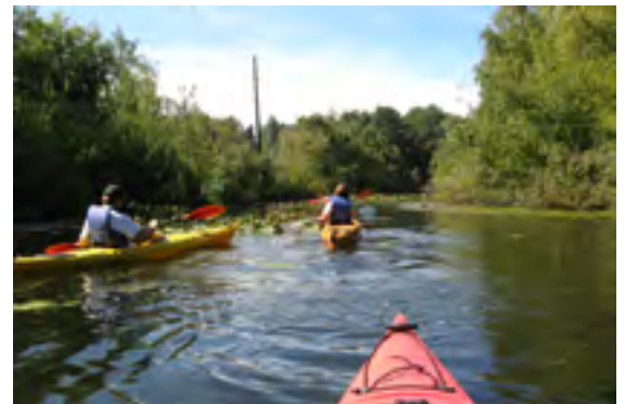
Mercer Slough Water Trail

The Washington State Recreation and Conservation Office (RCO) administers a variety of grant programs from federal and state sources to distribute to eligible application sponsors for outdoor recreation and conservation purposes. The amount of money available for grants statewide varies from year to year, and most funding sources require that monies be used for specific purposes. Grants are awarded to state and local agencies