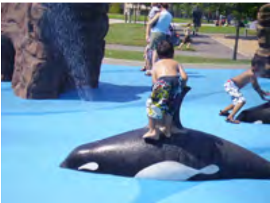
Crossroads Water Spray Play Area

Bellevue parks have benefited greatly from private donations. Volunteerism is a key source of donations, with volunteers providing thousands of hours per year to parks and park programming. In terms of capital projects, donations come in many forms, but typically, land is donated for future parks or cash support is provided from community organizations, businesses or individuals for a specific feature or facility within a larger project. In recent years, two Rotary service clubs in Bellevue have raised funds for the popular Crossroads Park Water Spray Play Area as well as the Inspiration Playground, designed for