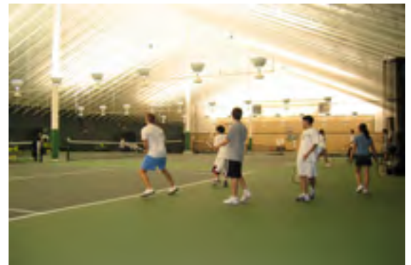
Robinswood Tennis Center

The City of Bellevue created a Parks Enterprise Fund to account for a number of activities in which user fees and charges are set to recover the cost of operations, including the Bellevue Golf Course, Robinswood Tennis Center, Bellevue Aquatic Center, and ballfield and facility rentals. Enterprise Fund revenues in excess of operating needs and reserve requirements are transferred to the CIP for Enterprise capital improvements, including the recent improvements to the Bellevue Golf Course driving range. In the future, the City may explore the expanded use of user fees to fund capital projects where feasible to do so.