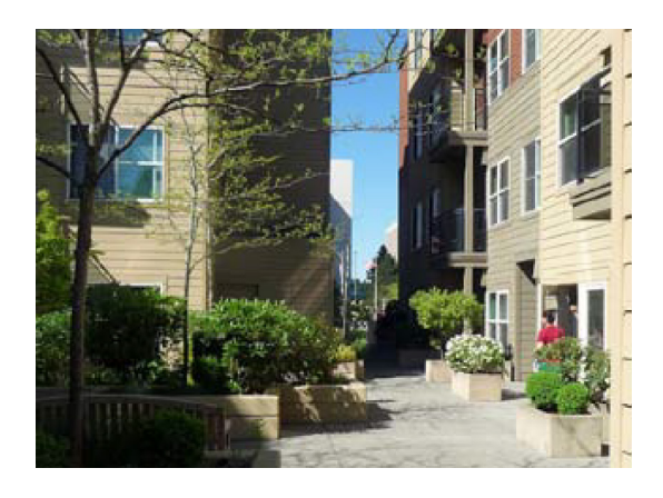
Through-block connections can be intimate and designed to protect residents' privacy.