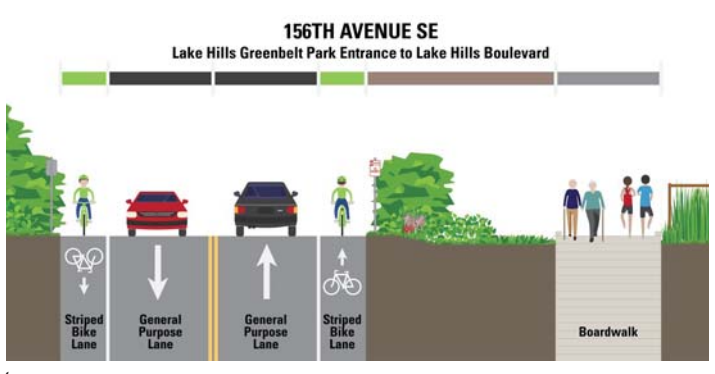
The above are representative illustrations of the planned bicycle improvements.

To stay informed, refer to the following tools: