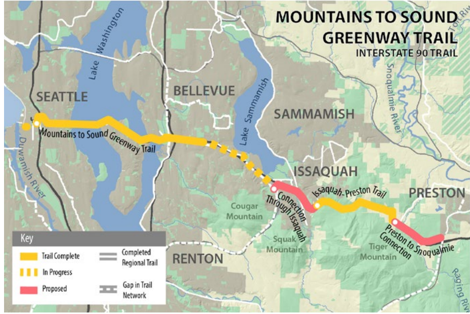
Corridor map provided by Mountains to the Sound Greenway Trust.