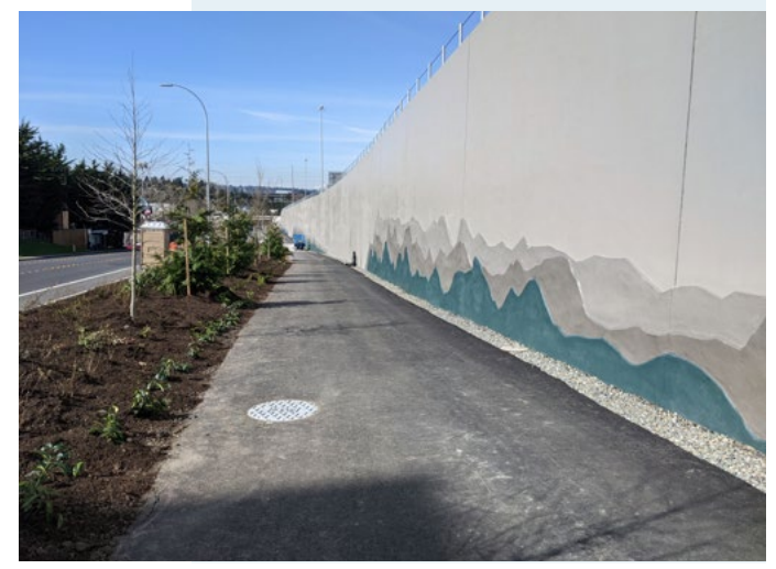
Decorative retaining walls along trail facing west

The $2.055 million was part of the larger, multimodal I-405/ Renton to Bellevue Widening and Express Toll Lanes Project where WSDOT collaborated with Bellevue to incorporate retaining walls that benefit both the Greenway Trail and the Interstate. The new pedestrian/bike tunnel was lengthened and built to allow WSDOT to expand the off-ramp from northbound I-405 to eastbound I-90 off-ramp.