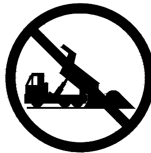
DECAL SYMBOLS (1" = 1'-0")