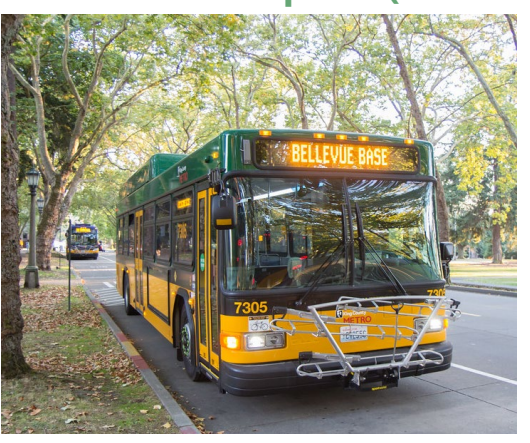
King County Metro Bus