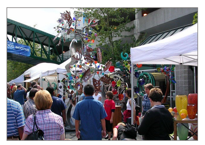
Bellevue Arts Fair

Visit the City's "Projects in Your Neighborhood" map: https://cobgis.bellevuewa.gov/Html5Viewer/index.ht ml?viewer=piyn